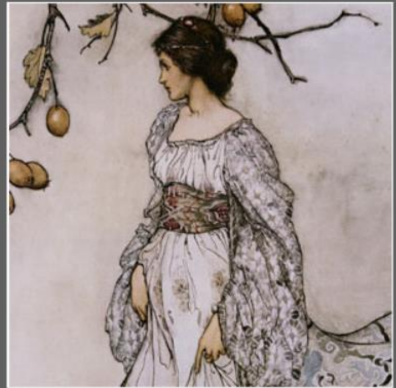
🔍 Romantic theme of nature shown in illustration of woman and a kiwi tree.